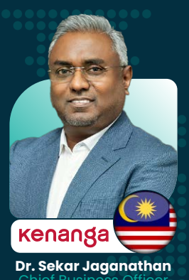
Kenanga Investment Bank Berhad Ultimate Access Education