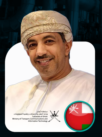
Founder & CEO, Digital Fuel for AI & Modern Technology Ministry of Transport, Communications & IT -Oman